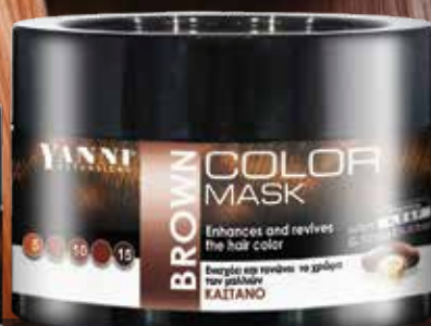
BROWN HAIR MASK CODE: 10060 250 ml.

Yanni Extensions professional hair color mask is designed to prolong the color effect on hair. Thanks to its enriched composition with Shea Butter oil, it regenerates, nourishes and moisturizes hair, making it soft without frizzing. It strengthens and enhances the color of your hair while at the same time it returns the shine to the dull, bleached or highlighted hair.