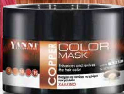
COPPER HAIR MASK CODE: 10062 250 ml.