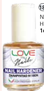
18160 Nail Hardener 16 ml.

• Ridge filler: Corrective base, covers nail lines to get a smoother nail base, apply before base.