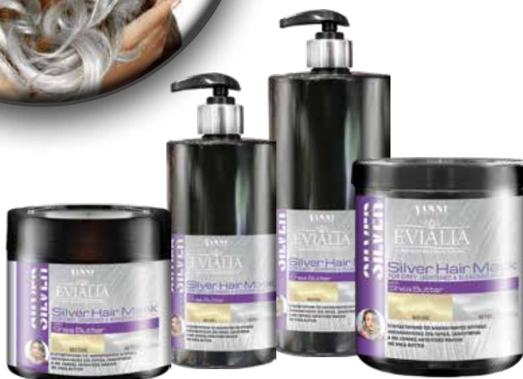
SILVER HAIR MASK

CODE: 11041 200ml / CODE: 11047 500ml. / CODE: 11031 1L. CODE: 11032 4 Lit.