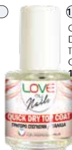
18164 Quick Dry Top Coat 16 ml.