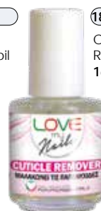
18166 Cuticle Remover 16 ml.