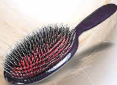
Brush for Extensions 17039