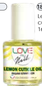
18165 Lemon cuticle oil 16 ml.