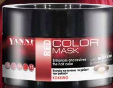
RED HAIR MASK KOKKINO CODE: 10061 250 ml.