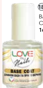
18163 Base Coat 16 ml.