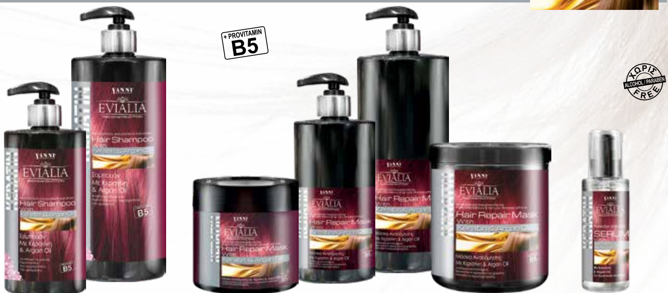
SHAMPOO CODE: 11028 1000 ml. / CODE: 11044 500 ml.