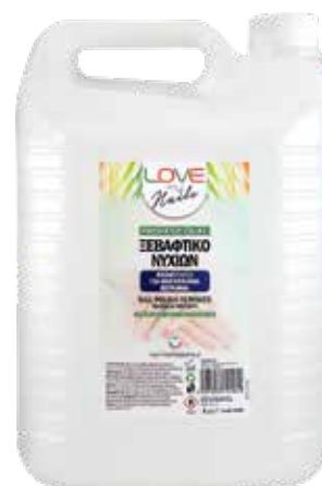
12402 Nail Polish Remover 4lit