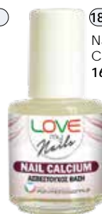
18162 Nail Calcium 16 ml.