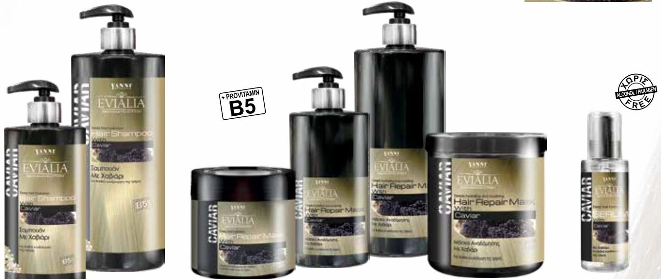
SHAMPOO CODE: 11040 1000 ml. / CODE: 11046 500 ml.