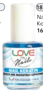
18161 Nail Keratin 16 ml.