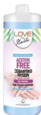
12401 ACETON NON ACETON gel polish remover 1lit