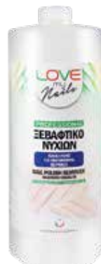
12400 Nail Polish Remover 1lit