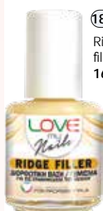
18171 Ridge filler 16 ml.